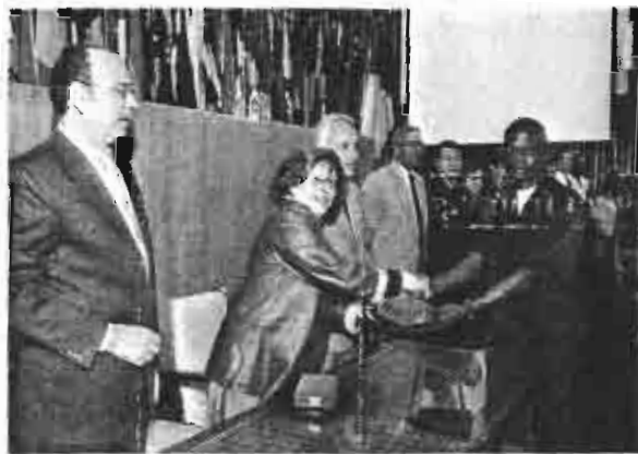
Distribution of Certificates

Upon the termination of each course the centre awards a certificate of achievement for active participation and attendance level of at least 90% of the course duration.