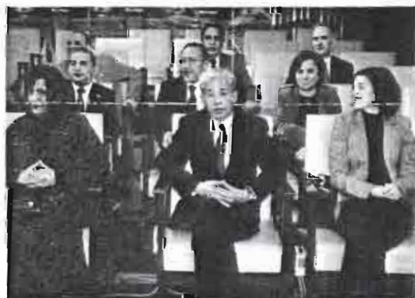
Ambassadors attending the closing ceremony