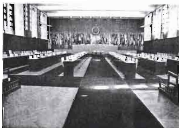
Auditorium of the centre

It is worth mentioning that the objectives of the centre are not only to train in - service agronomists from Africa, Asia,