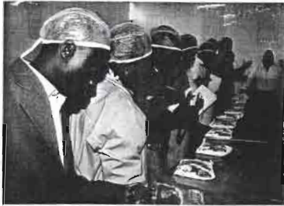
Trainees at the field visits