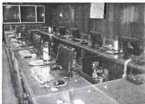
Lecture hall equipped with computers

Tripartite training programmes are held in collaboration with different international agencies for training participants by EICA in several agricultural fields.