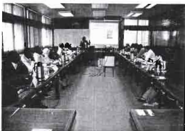
Participants at the lecture hall

Latin America and Eastern Europe in various fields of agriculture, but also to bring together agricultural talents from all countries for a first-hand understanding and appreciation of each other's problems and help evolve, by pooling of knowledge, new techniques in agricultural development adapted to the conditions of these countries.