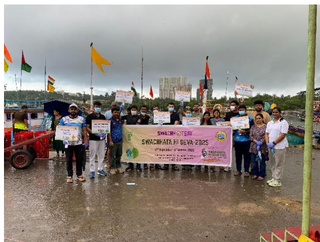
Fig 1: The team of faculty and students of CIFE who participated in the cleanliness drive at Versova beach

Name of Activity: Cleanliness Drive in Versova Beach and Landing Centre, Mumbai