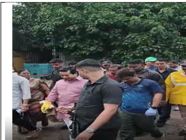
Fig 5 Honorable minister with staff and students of CIFE during cleanliness drive