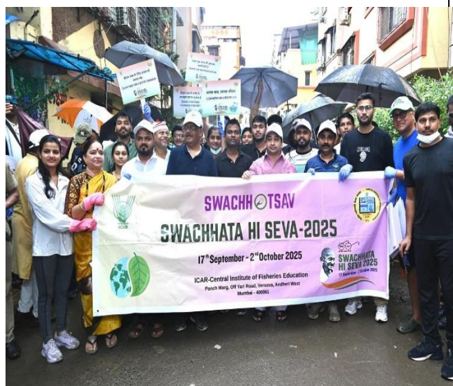
Fig 3: A rally through Versova with Shri. Nitesh Narayan Rane, Hon. Minister of Ports Development of Maharashtra to create awareness among the residents near landing center and beach to minimize litter and plastic pollution.