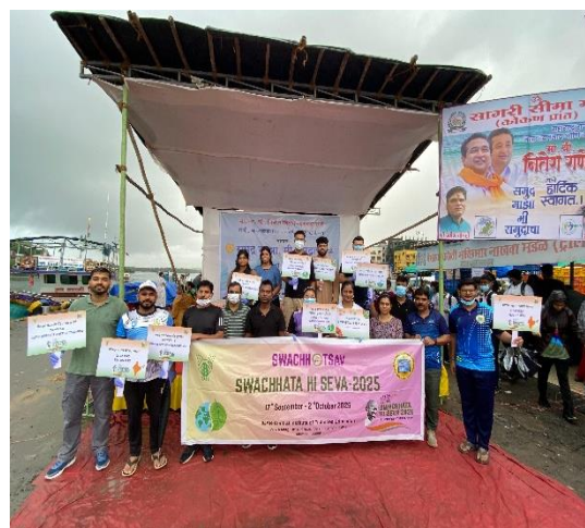
Fig 2: CIFE Team at the inaugural venue of Swachhta Abhiyan