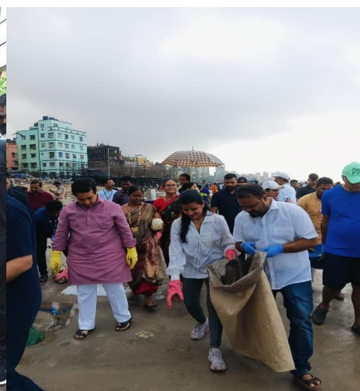
Fig 4: Cleaning by collection of litter and plastic