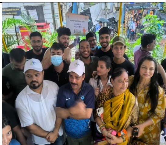
Fig 6: CIFE staffs and students during the awareness programme