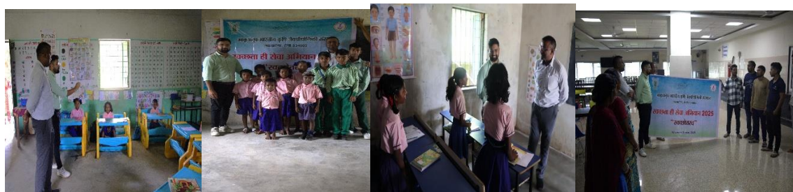
Briefing the students about Swachh Bharat Abhiyan

These activities not only deepened awareness but also inspired participants to act as Swachhta Ambassadors, spreading the message of cleanliness and responsibility within their schools, workplaces, and communities. The programme reflected the true spirit of the campaign—“Ek Kadam Swachhta Ki Or”—encouraging everyone to contribute towards building a cleaner, greener, and healthier India.