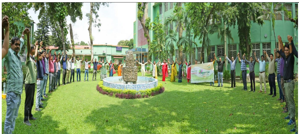
Formation of Human Chain by ICAR-NINFET Staff

As part of the fortnight-long celebration of Swachhta Hi Seva 2025 (September 17 – October 2, 2025), Human Chain was formed by the all staff members of the ICAR-NINFET where all have joined their hands to raise Swachhta awareness.