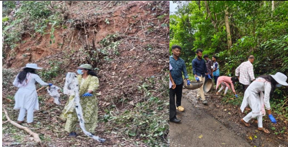
Reduce, Reuse, Recycle Activities