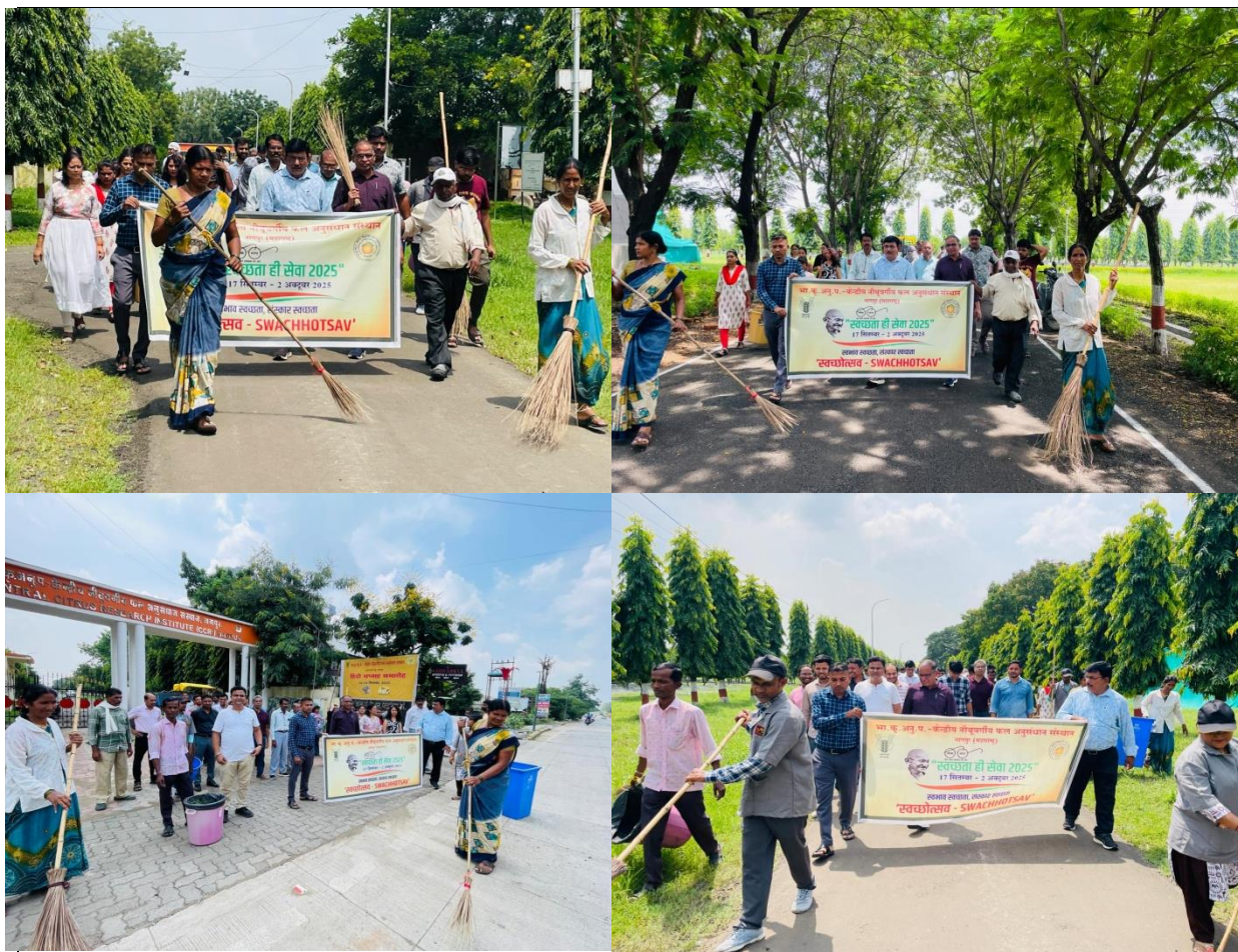
Dated: 22.9.2025; Glimpses of cleanliness drive “ Theme: Human Chain at ICAR-CCRI, Amravati Road, Nagpur under Special “Swachhta Campaign 5.0” 2025 on dated 22.09.2025.