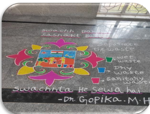
Depiction of Waste Segregation for Stronger India