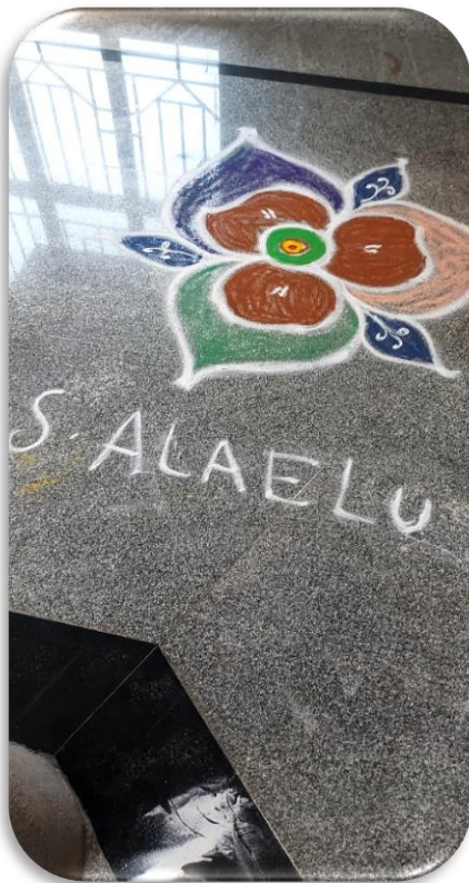
Origami Petals for Cleaner Earth