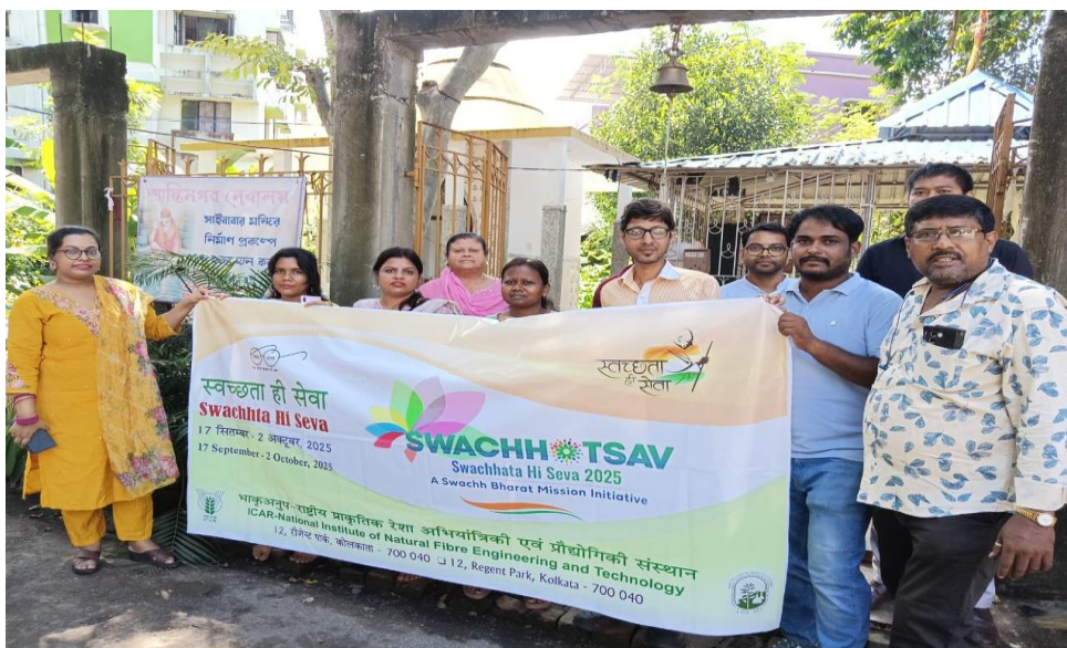
Awareness campaign cum Cleanliness Drive at religious place on 26.09.2025