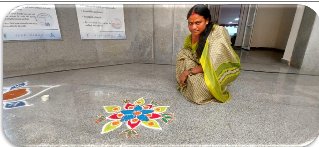
Creator and her creativity