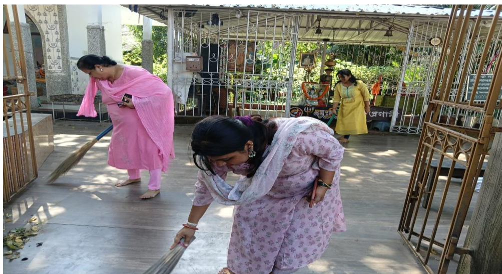
Cleanliness drive at religious place