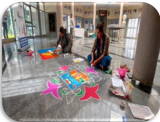
Zeal with imageries and hues : Rangolis in creation

Event : Kaleidoscope of 'Rangolis' depicting cleanliness