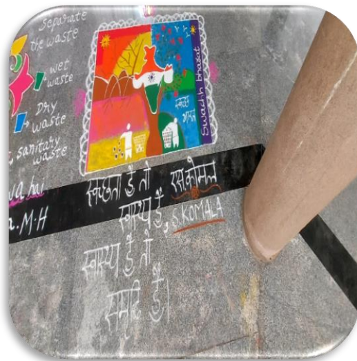
Linearity of Cleanliness with Health