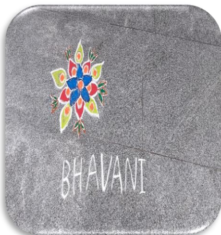
Floral Symmetry and Harmony in Cleanliness