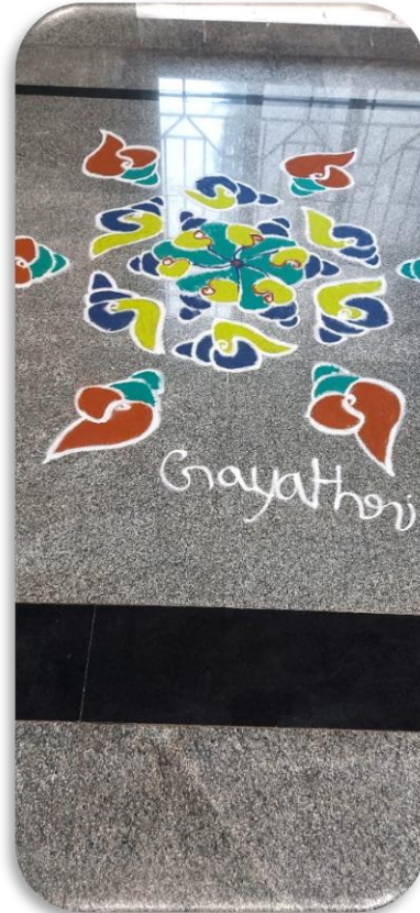
Melting Point of Religion and Culture in Cleanliness