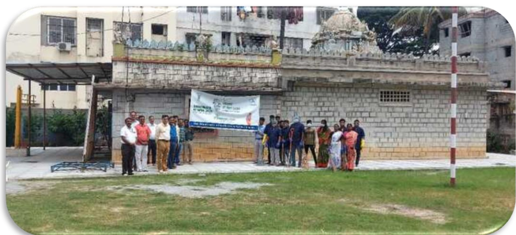
AFTER : Completing Cleaning of the Lawn...Green spread panoramic...Speck and Span