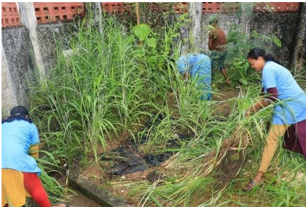
Fig 2A. Behind ATIC building (before)