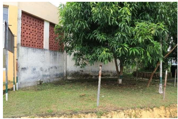
Fig. 4 After