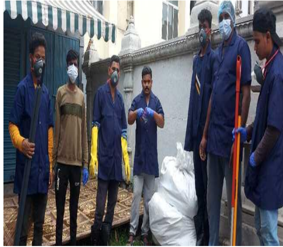
Finally, the collected debris were packed in large bags were kept at the designated points for the city corporation sanitary vehicle to collect and dispose.