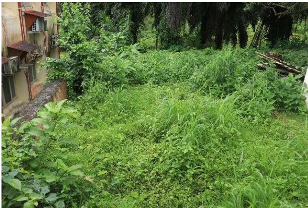
Fig 1A. Behind Administrative building (before)

Dirty areas have been identified for cleaning in a timely manner. The identified locations include the area near the canteen, behind the library, behind the ATIC, behind the central lab, the temple area, and the quarters. The photographs of before and after are mentioned below