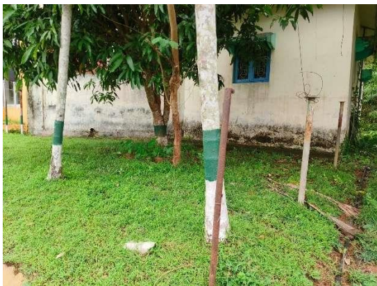
Fig 4A. Behind ATIC building (before)