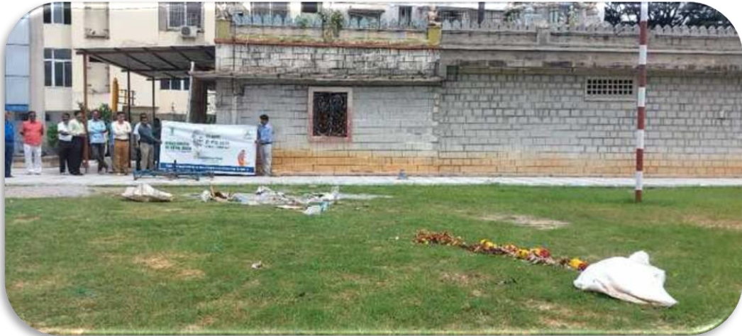
BEFORE : Onset of Cleaning Drive - Lawn strewn with floral refuse, left-overs of incense burns, discarded garlands, plastic bottles, dry leaves and rubber hose.