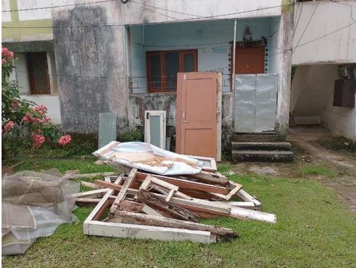
Fig. 5 After