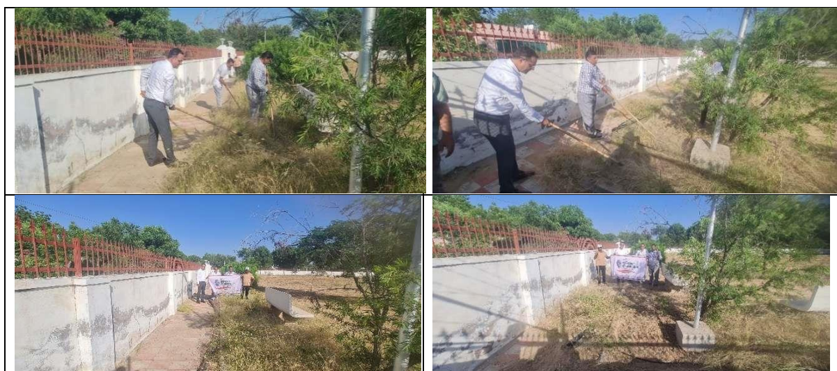
Cleanliness drive at children park of the institute premise under Swachhta hi Sewa programme

Swachhta hi Sewa Programme (17 September-02 October, 2025)