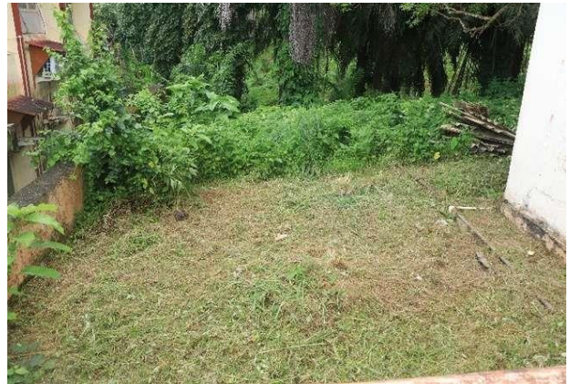
Fig. 1 After