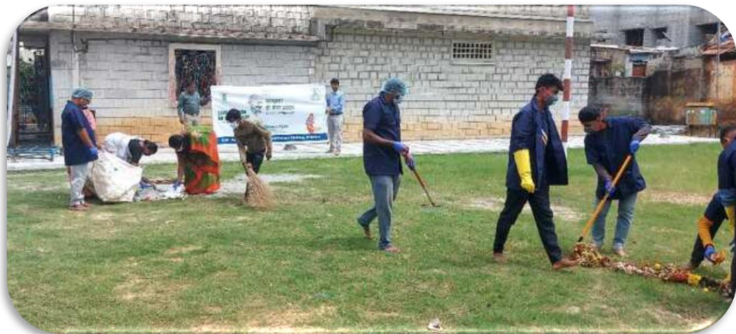
Cleaning Operation in Progress