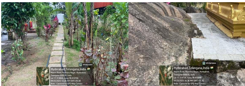
After cleaning of temple area