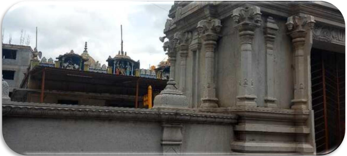
Facade of the Sri Vengopala Swami Devasthanam (Sri Krishna Temple), at the neighbourhood of Adugodi Circle