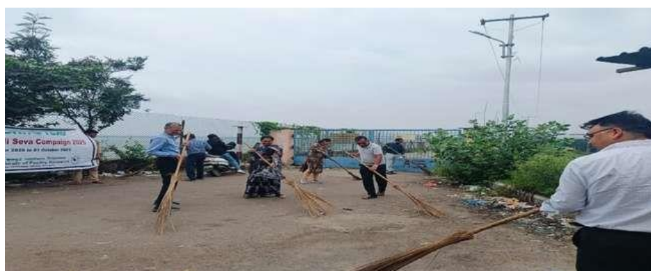
DPR staff engaged in cleaning activity

I.C.A.R- Agricultural Technology Application Research Institute (ATARI) Zone-VII, Umiam - 793103, Meghalaya (INDIA)