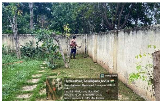
Brush cutter Operation inside the compound wall of the temple area