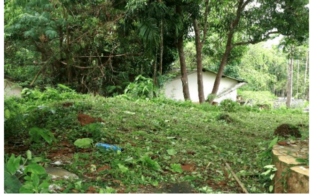
Fig. 3 After