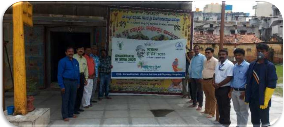
Institute Staff Team participating at the Temple Cleanliness Drive

Spot : The Lawn adjacent to the Shrine within the TEMple Premise