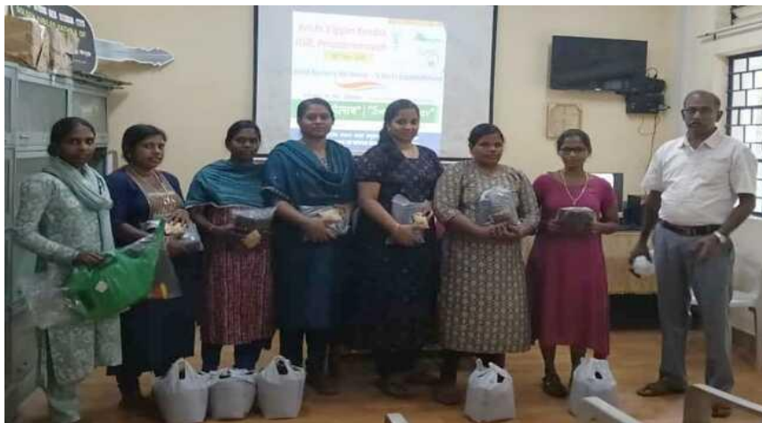
Distribution of nursery kits to SC beneficiaries as part of Swachhta Hi Seva Campaign

Swachhta Hi Seva Signature drive organized at ICAR – IISR Regional Station, Appangala A part of Swachhta Hi Seva Campaign and ATARI - SCSP, training and distribution of nursery kits to SC beneficiaries to establish five satellite neem nurseries were organized at ICAR – IISR KVK, Peruvannamuzhi. This initiative promoted environmental as well as livelihood empowerment by fostering neem cultivation for ecological and medicinal benefits.