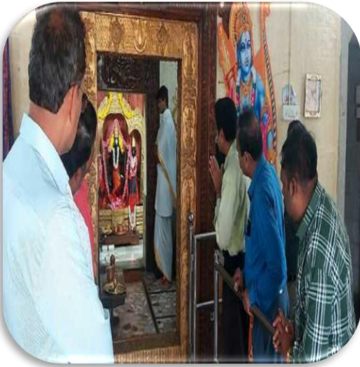
Post Cleanliness Drive, prayers were made before the Deity for the well-being of all.