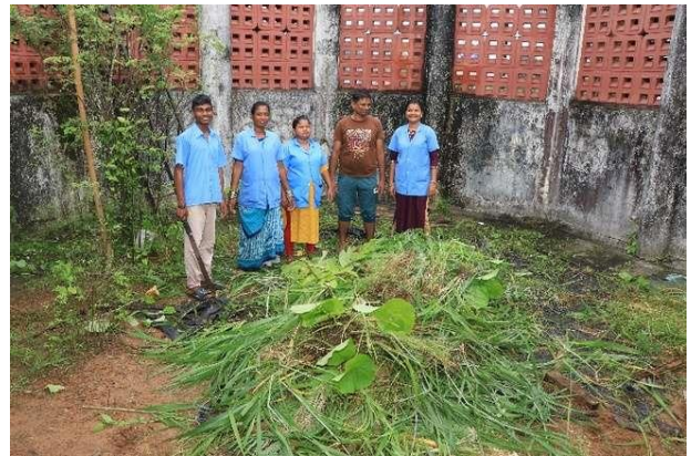
Fig. 2 After