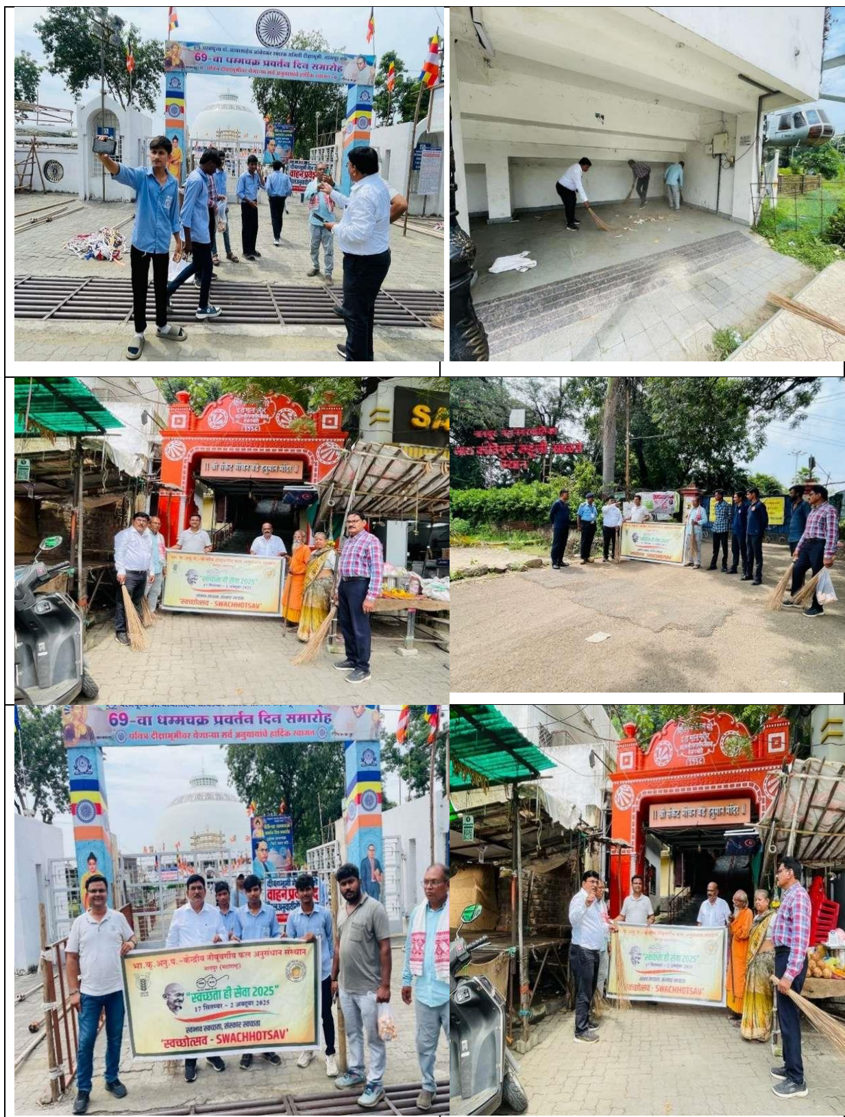
Dated: 24.09.2025; Glimpses of cleanliness drive “ Theme: Tourist Spots, Religious & Spiritual Places at ICAR-CCRI, Amravati Road, Nagpur under Special “Swachhta Campaign 5.0” 2025 on dated 24.09.2025.