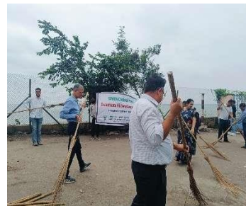
DPR staff engaged in cleaning activity