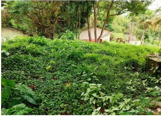
Fig 3A. Behind ATIC building (before)